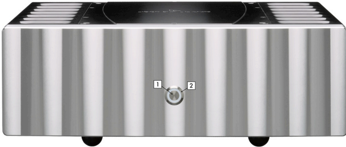
Figure 1: Front Panel